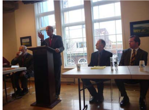
Peter Welch Speaking at HUD Grant Press Event October 2010