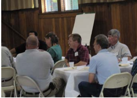
Joint CCRPC/CCMPO Board Meeting November 2010