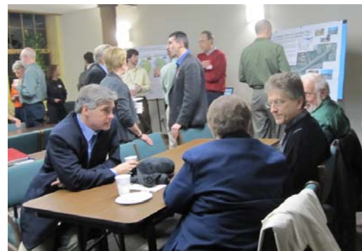
CCRPC/CCMPO Legislative Reception November 2010

In addition, fifty-seven other Vermont communities applied for municipal planning assistance totaling $535,029. Available state-wide funding was $417,588.