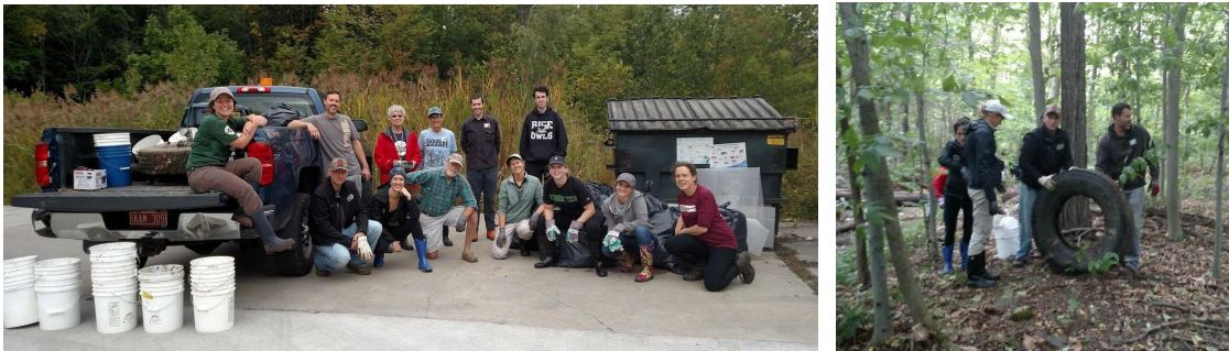
Figure 10: Volunteers at the Williston Stream Clean Up 9/14/19

In partnership with Winooski NRCD, RRST completed a Stream Clean Up event in Williston on Sept 14, 2019. Eleven people attended and removed 15 bags of trash out of two tributaries to Muddy Brook. Most of the time spent on this event was covered by Winooski NRCD’s independent agreement with the Town of Williston. Some advertising time was charged to RRST and Stream Team tabling materials and shirts were shared with all participants on the day of the event. The cost to RRST was approximately 10 hours or $450 . Matching funds from WNRCD to fully execute the event were approximately $3,500.