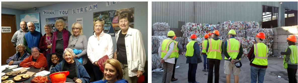
Figure 14: Volunteers enjoy breakfast and tour the CSWD Materials Recycling Facility as part of the 2019 volunteer appreciation event. (9/18/19)