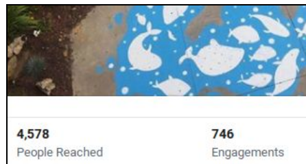
Fig 6: Social Media Splash! The Facebook post about the completed murals was shared by more than 10 people or organizations and seen by over 4,500 people.