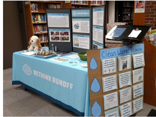
Figure 2: Left: Books from the Clean Water Reading List on display at Brownell Library. Right: Tabling display set-up including the new Clean Water Trivia Board and newly printed Rethink Runoff tablecloth

The 2019 work plan goal for outreach was 80 people, which was surpassed. A total of 278 people were engaged through outreach in 2019. Outreach towns for 2020 are Williston, Winooski and South Burlington.