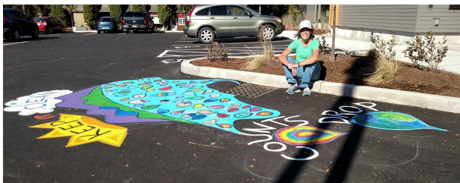
Figure 8: Artist Julie Holmes's Mural outside of Pierson Library (9/27/19) Text says: "Every Drop"