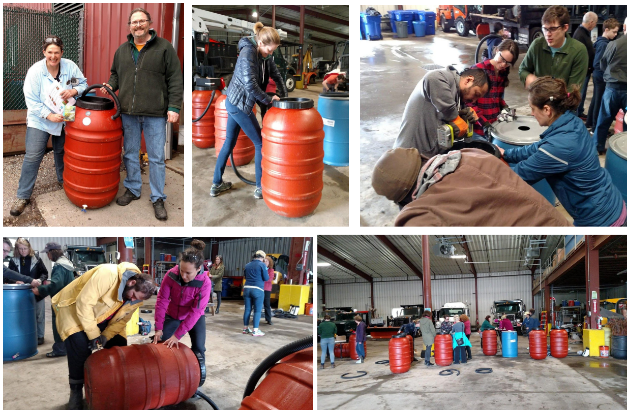
Figure 3: Participants at the Burlington Rain Barrel Workshop drill, assemble and caulk their new barrels.