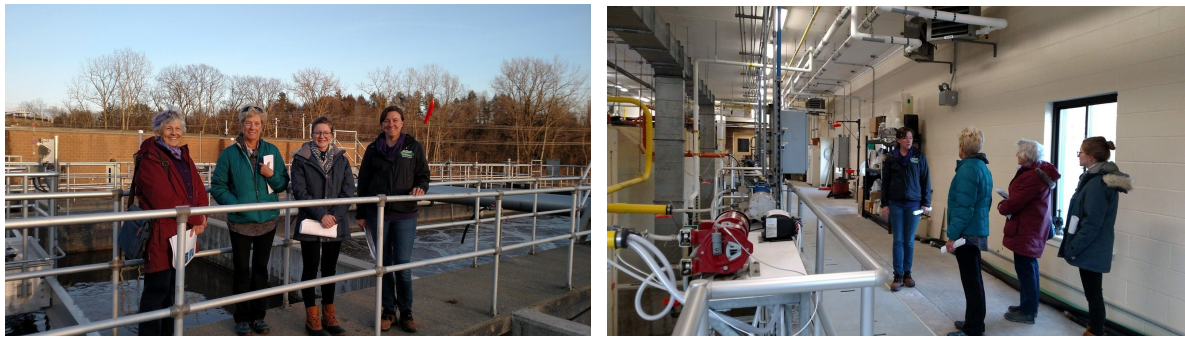
Figure 13: Volunteers tour the Essex Junction Wastewater Treatment Facility as part of the 2018 volunteer appreciation event. (3/20/19)