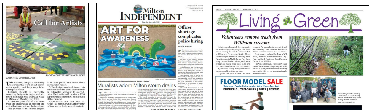
Figure 1: Thumbnails of some 2019 RRST appearances in local newspapers