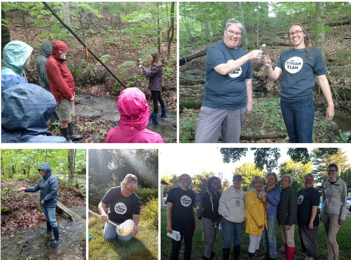
Figure 12: Stream Team volunteers learn sampling protocol at the evening training (6/11/19)