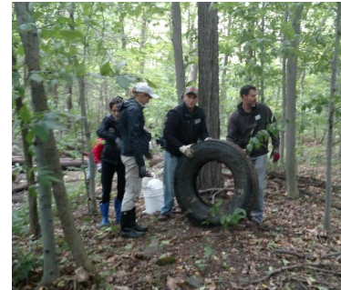
Figure 10: Volunteers at the Williston Stream Clean Up 9/14/19