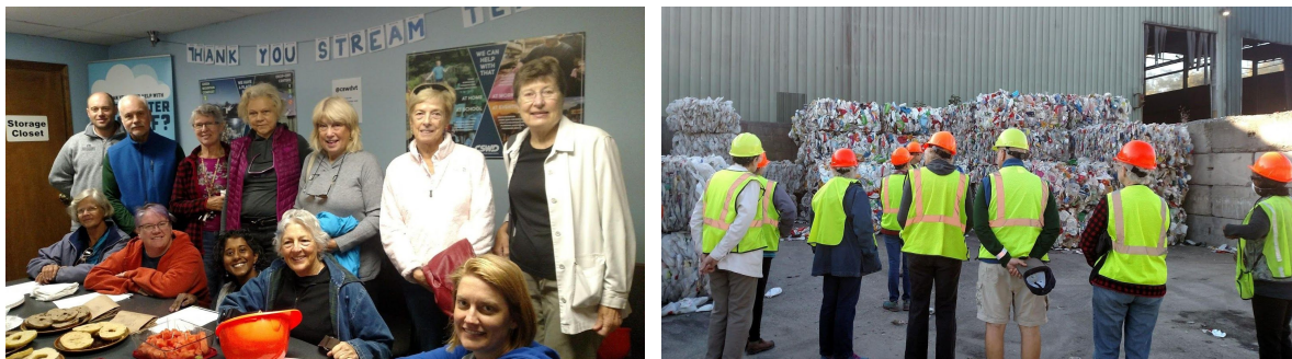
Figure 14: Volunteers enjoy breakfast and tour the CSWD Materials Recycling Facility as part of the 2019 volunteer appreciation event. (9/18/19)