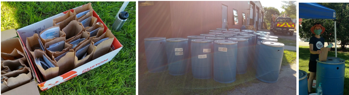
Left to right: Hardware kits with Rethink Runoff handouts ready to be distributed, rain barrels with pre-drilled holes wait to be picked up by participants, Kristen masked and ready for a covid-safe distribution day

Total # of residents in Rethink Runoff towns participating in hands-on events ~ 40